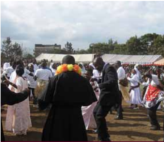
Holy Cross religious and families celebrate after a Mass of Final Profession of Vows.

How about the faces that I observe around the table, or the soft drumming at Mass and the host in my hands? For the man vowed to poverty, each day slowly becomes enough. We learn anew how to enjoy life as when we were little children. When our vision is clear, we even learn to appreciate what is ugly and unpleasant in life but given to us, nonetheless.